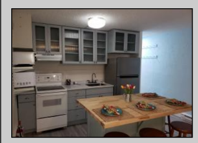
5605 Seaview Wildwood Crest, NJ 08260