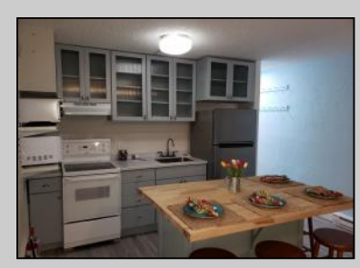
5605 Seaview Wildwood Crest, NJ 08260