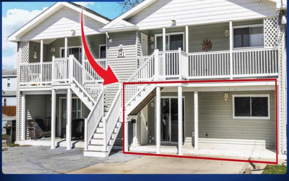
347 E 21ST AVENUE, NORTH WILDWOOD, NJ