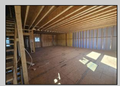
2410 New York North Wildwood, NJ 08260