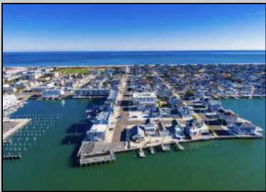
8307 Sunset Stone Harbor, NJ 08247