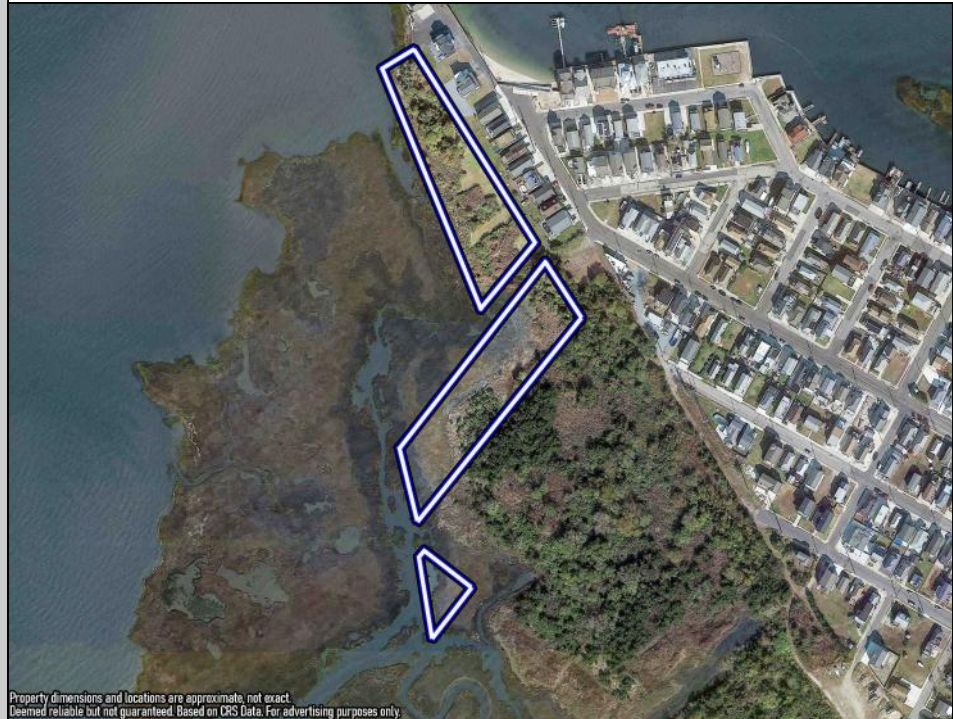
Property dimensions and locations are approximate, not exact. Derived reliable but not guaranteed. Based on CRS Data. For advertising purposes only.