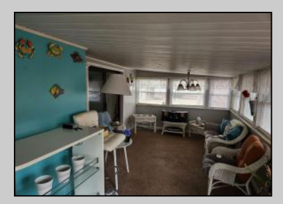
561 Corson Tavern Ocean View, NJ 08230