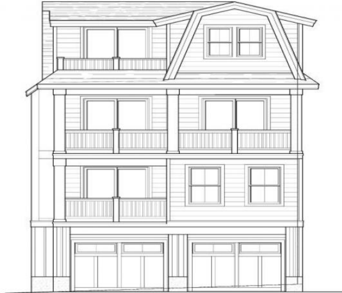
PARK ROAD ELEVATION