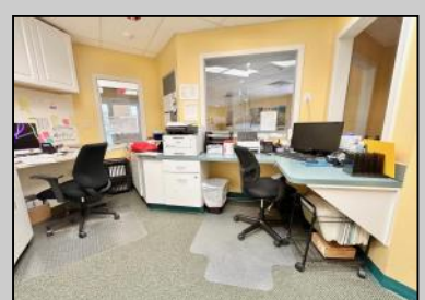
804 Route 9 South Cape May Court House, NJ 08210