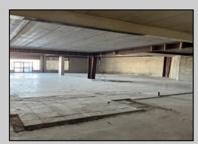
3401 New Jersey Wildwood, NJ 08260