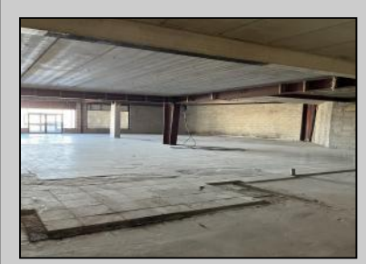
3401 New Jersey Wildwood, NJ 08260