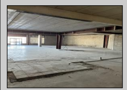
3401 New Jersey Wildwood, NJ 08260