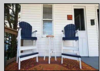
222-24 Poplar Wildwood, NJ 08260