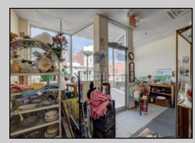
4501 Pacific Wildwood, NJ 08260