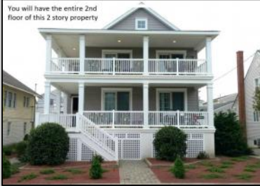
You will have the entire 2nd floor of this 2 story property

1222 Wesley Avenue 2nd Floor, Ocean City