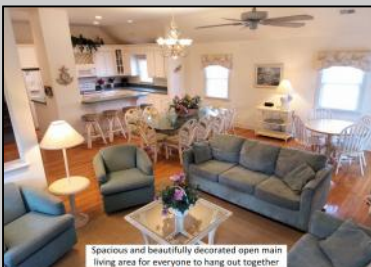
Spacious and beautifully decorated open main living area for everyone to hang out together