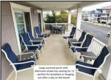
Large covered porch with afternoon shade has seating for 12 -- perfect for breakfast or hanging out after a day on the beach